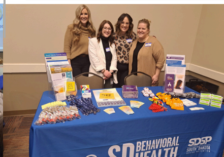
SD DSS- Division of Behavioral Health team