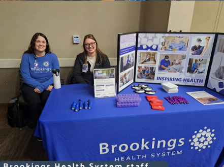
Brookings Health System staff